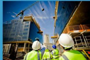
BUILDING & CONSTRUCTION