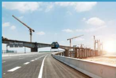
ROAD & BRIDGE