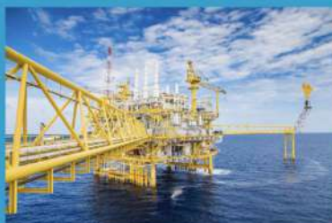
OPERATION & MAINTENANCE