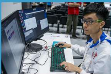
IT & SOFTWARE